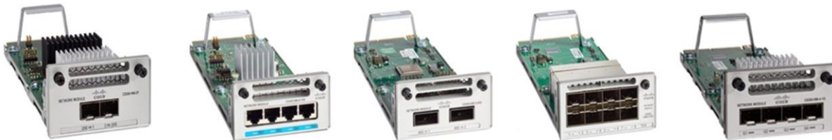
Figure 3. Cisco Catalyst 9300 Series Network Modules