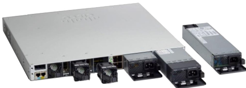
Figure 4. Cisco Catalyst 9300 Series Dual Redundant power supplies

Cisco Catalyst 9300 Series switches support dual redundant power supplies. The switches ship with one power supply by default, and the second power supply can be purchased when the switch is ordered or at a later time. If only one power supply is installed, it should always be in power supply bay #1. The switches also ship with three field-replaceable fans. Power Supplies are common across the Catalyst 9300 Series.