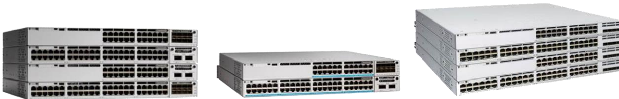
Figure 1. Cisco Catalyst 9300 Series switches

The Cisco Catalyst 9300 Series is made up of nineteen modular uplink switch models and fourteen fixed uplink switch models.