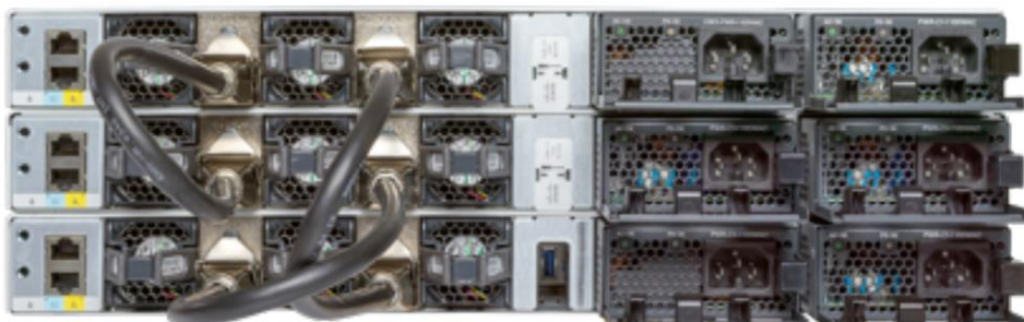
Figure 6. Cisco Catalyst 9300 Series fixed uplink models with optional stack kit