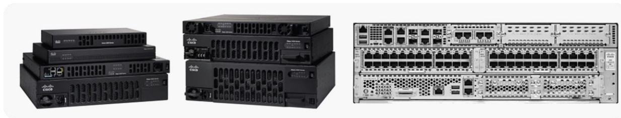
Figure 1. Cisco 4000 Series Integrated Services Routers

The Cisco 4000 Family contains the following platforms: the 4461, 4451, 4431, 4351, 4331, 4321 and 4221 ISRs.